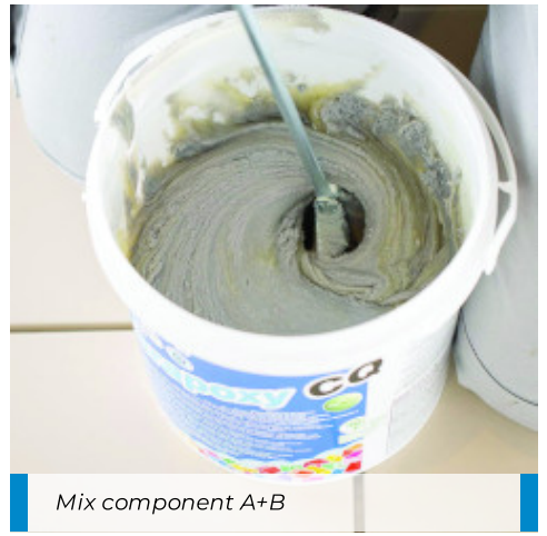
Mix component A+B