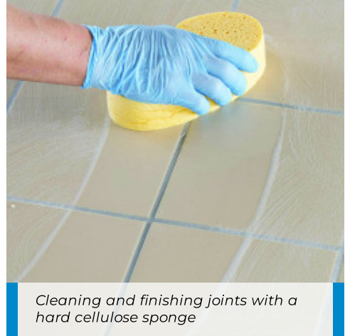
Cleaning and finishing joints with a hard cellulose sponge