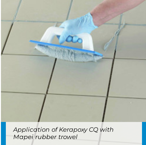
Application of Kerapoxy CQ with Mapei rubber trowel