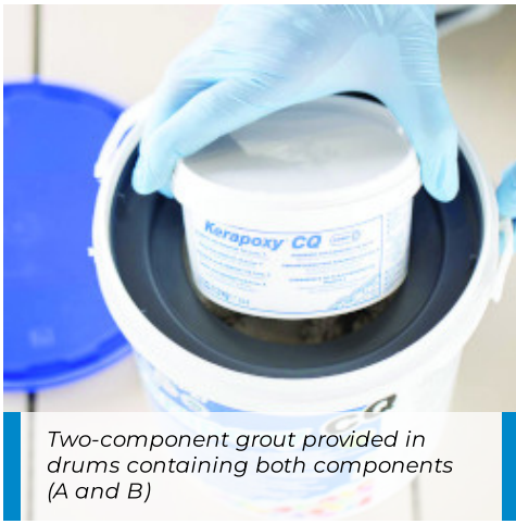
Two-component grout provided in drums containing both components (A and B)