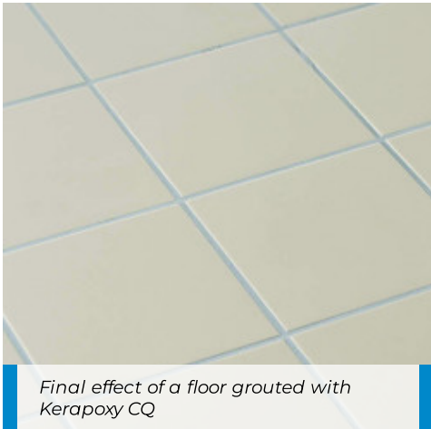
Final effect of a floor grouted with Kerapoxy CQ