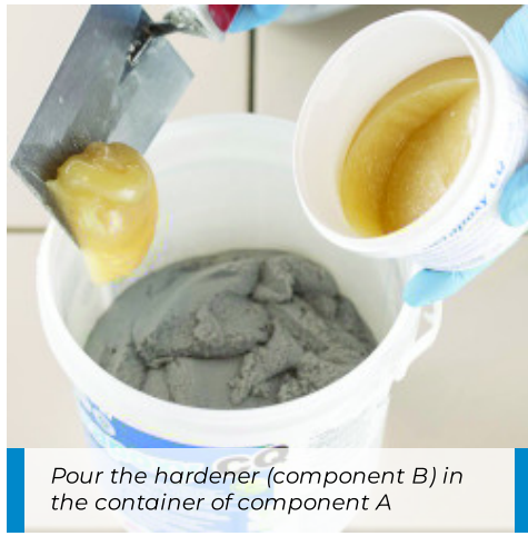
Pour the hardener (component B) in the container of component A