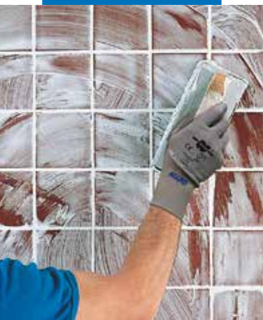
Laying the product with a rubber float

No warranty can be given or responsibility accepted other than, that the product supplied by us will meet our written specification. End users should ensure that our latest product data and safety information sheets have been consulted prior to use.