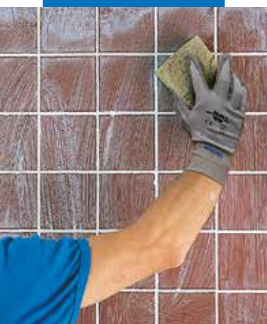
Cleaning with a sponge