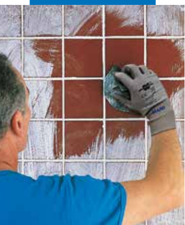
Cleaning with a cloth